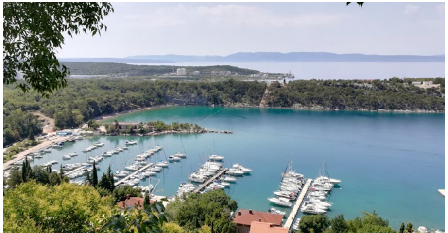
Omišalj view on bay and Dioki industrial site.

At the core of Sanader's story is an alleged EUR 10 million bribe that Ivo Sanader took from the Hungarian energy company MOL to facilitate a favourable deal for the purchase of the majority stake in the Croatian energy company INA, as a part of its privatisation process.